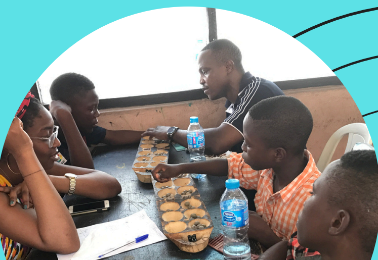
Gamesville Foundation members playing games with the boys

RESCUE: The SCCWI rescue team visits places where vulnerable children make their abode which include Kuramo beach, Oshodi, Mushin, and other black spots across the metropolis. Interactions and counseling take place during the initial encounter at these locations, after which the children are taken to the center for further counseling depending on the peculiarity of their challenges.