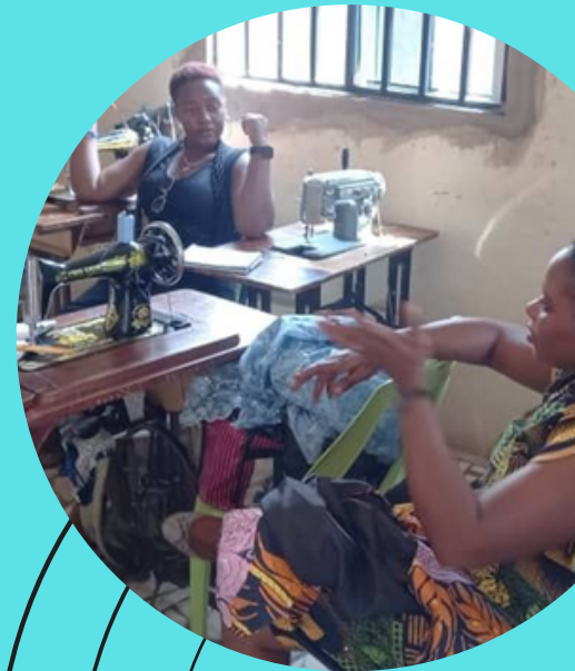
Beneficiaries of ICSS entrepreneurship training

MSME ENTREPRENEURSHIP TRAINING: SEYP is also an implementing partner of the Inspire, Create, Start, Scale (ICSS) entrepreneurship development training developed by GOPA Consultants for the GIZ SEDIN Program. The training is for Micro, Small, and Medium Enterprises (MSMEs). A needs assessment is done for each beneficiary and after care is provided after the training to ensure sustainability. SEYP has trained 500+ beneficiaries till date.