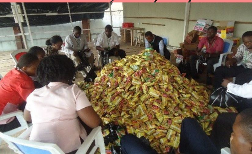
Noodles packaging for JCC