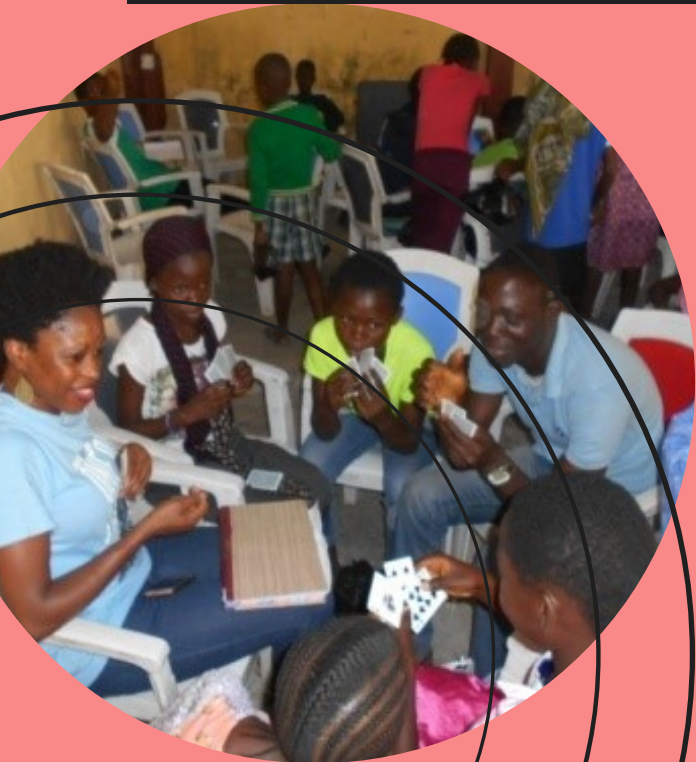
Gamesville Foundation members playing games with children during a JCC session