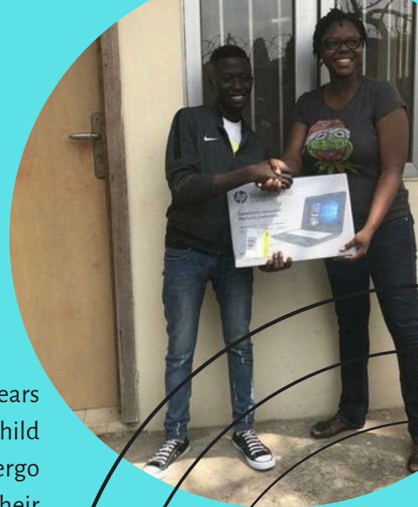
1st and 2nd place winners of the 2018 Gamesville Foundation Tournament

AFTER CARE SERVICE: After reintegration, SCCWI still continues to sponsor, counsel, monitor, and guide children at home, as most parents are poor and unable to cater for all the educational needs of their children.