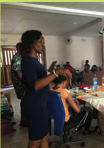
Gamesville Foundation member giving a talk on life after trauma (left). Playing games with the girls (right)

COUNSELING: The girls are provided with trained counselors that counsel them on vital issues, including but not limited to self-esteem, hygiene, safety, and life decisions. The girls are engaged in various transformational activities which will aid healing and reintegrate them with their families and society.